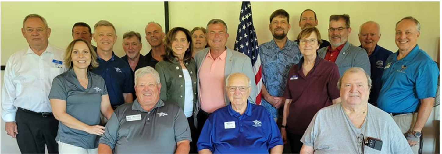
Participants in the 2025 AFA Florida State Convention sat for a group photo after the convention meetings.