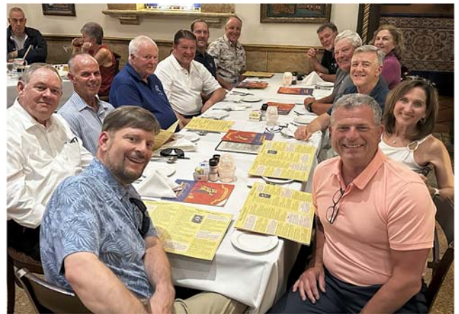
2025 AFA Florida State Convention Participants sat for some fine dining at a Tampa restaurant after the convention meetings.