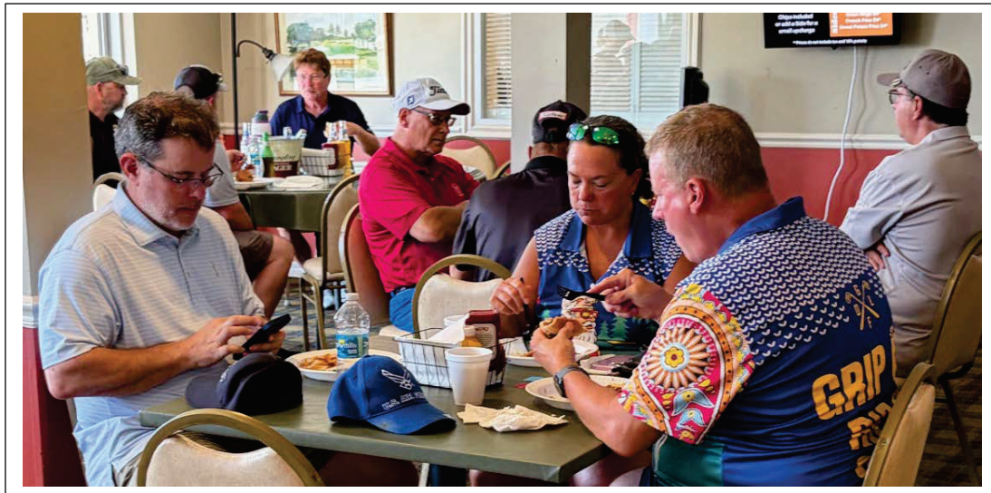
Post-tournament, there was dinner for all.