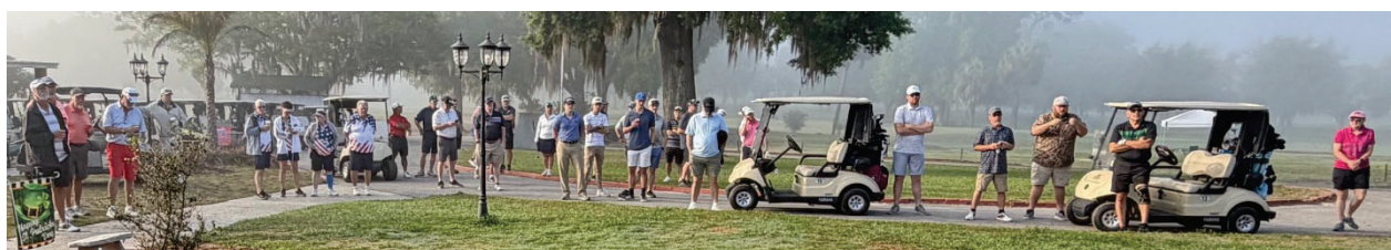
On a beautiful Florida day that began with fog and ended in sunshine, players await instructions before the tournament.