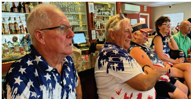
This foursome played in patriotic colors.